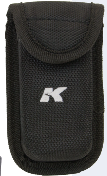
Carrying case included